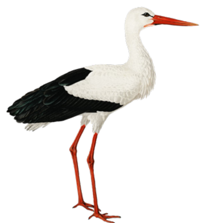
FIG. 1. — OOIEVAAR ( CICONIA CICONIA )

De ooievaar is een vogel uit de familie van de ooievaars. Ooievaars zijn een groep grote vogels met lange poten en een lange hals. Zij hebben een lange, rechte en stevige snavel. De ooievaar wordt ook wel uiver, eiber of stork genoemd.